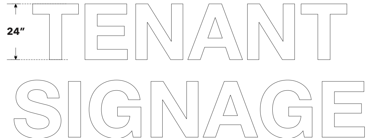
TENANT SIGN - TWO LINES