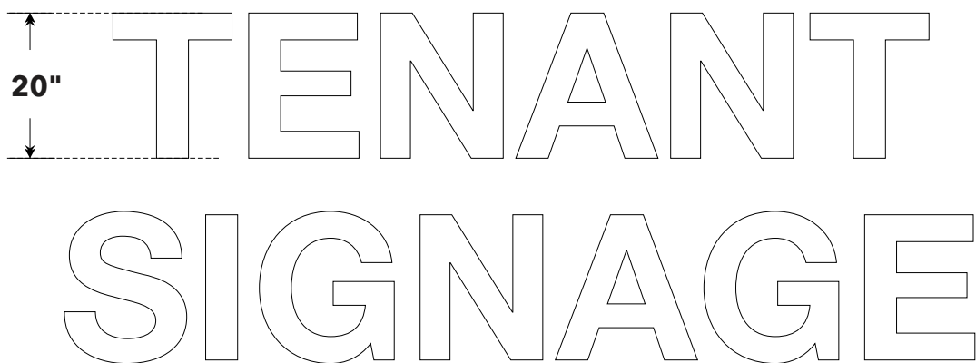
TENANT SIGN - TWO LINES